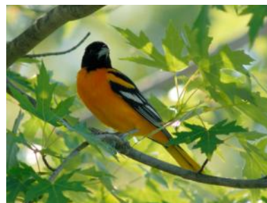
Baltimore Oriole

Enjoy bird related crafts and games throughout the day.